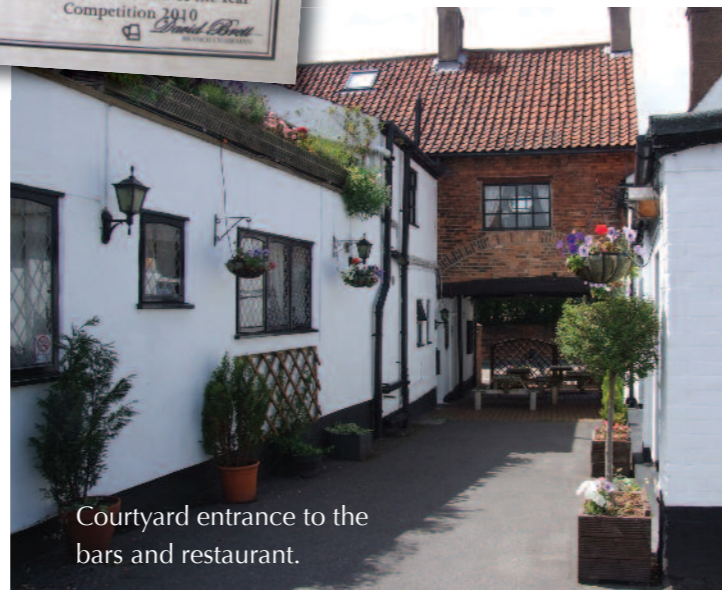
Courtyard entrance to the bars and restaurant.